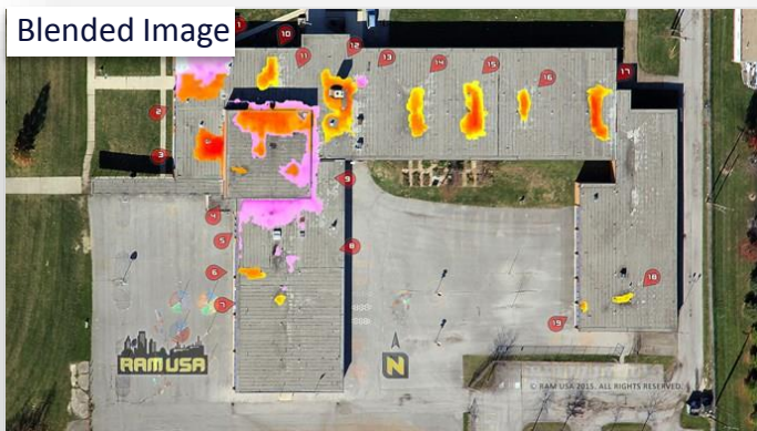
Pinpoints thermal anomalies in need of further investigation